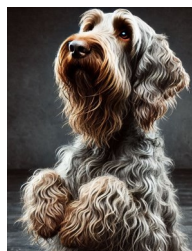
Spinone Club of America