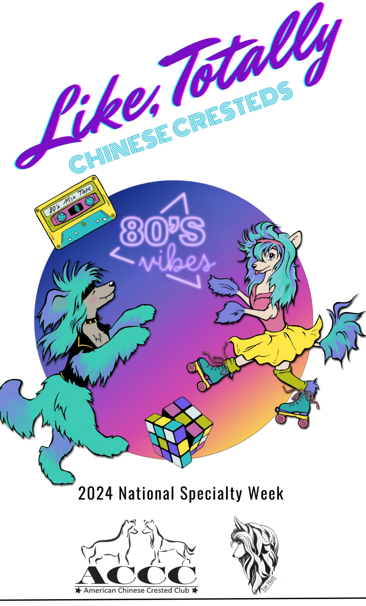
Roberts Centre 123 Gano Road + Wilmington, Ohio 45177