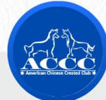
ACCC RECOMMENDED HEALTH TESTING