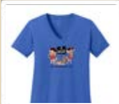
WOMEN'S V NECK