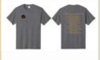
UNISEX TOP 20 TEE