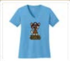
WOMEN'S V NECK