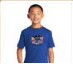
YOUTH SHORT SLEEVE