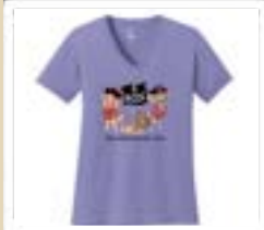
WOMEN'S V NECK