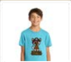
YOUTH SHORT SLEEVE